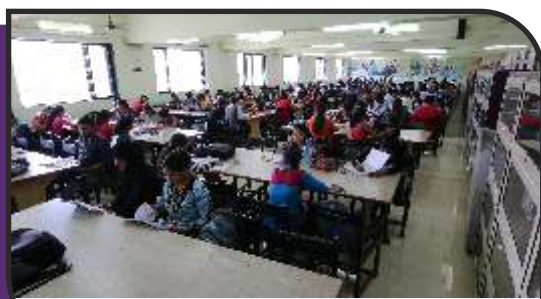
Reading Room at Central Library