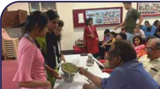
Research Promotion Cell