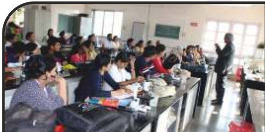
Workshop on Mycology for Students organized by Department of Botany