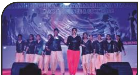
Performance at Annual Function "Utopia"