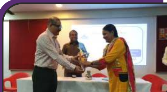
Celebration of National Science Day