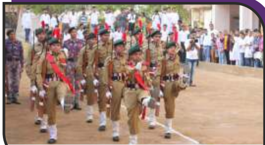
National Cadet Corps (Girls Unit)