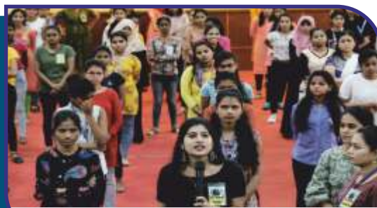
Self-Defence Workshop for Girls Students