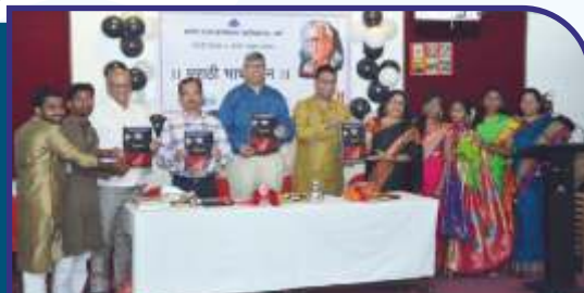
Celebration of Marathi Bhasha Divas organized by Department of Marathi