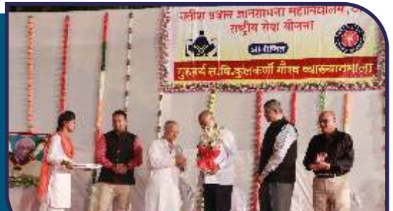
S.V. Kulkarni Lecture Series