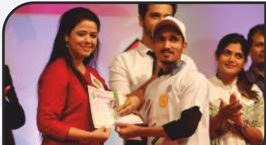
NSS Volunteer with Celebrities