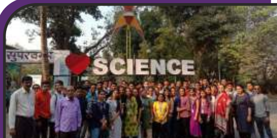
Visit to Nehru Science Centre by Department of Physics