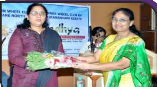
Women Development Cell