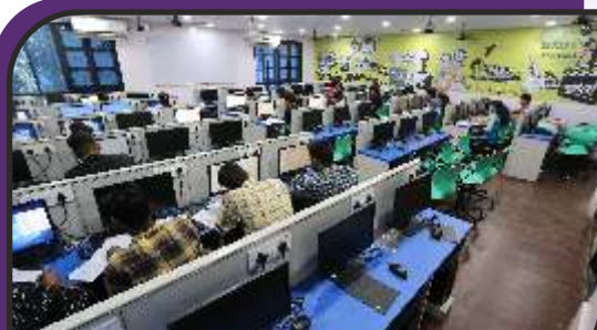
Computer Science Laboratory