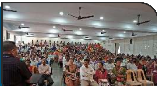
Kavivarya P. Savalaram Hall