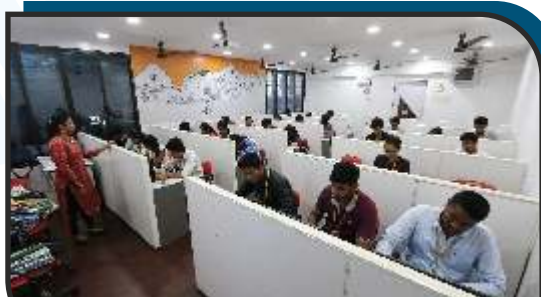
Information Technology Laboratory