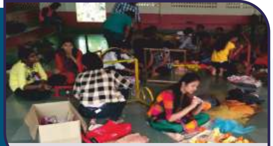
Students' Activity Centre