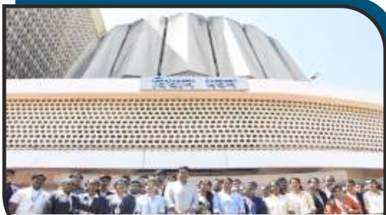
Visit to Vidhan Bhavan