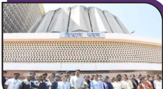
Visit to Vidhan Bhavan