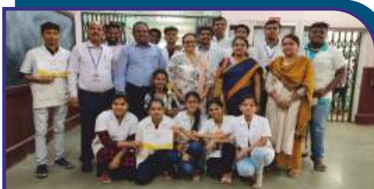
Winners of Poster Competition Conducted by Department of Chemistry