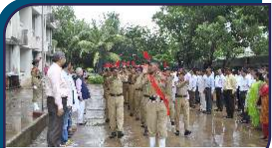
National Cadet Corps (Boys Unit)