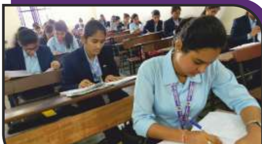
Workshop on Research Methodology