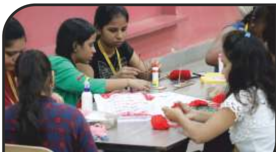
Students' Activity Centre