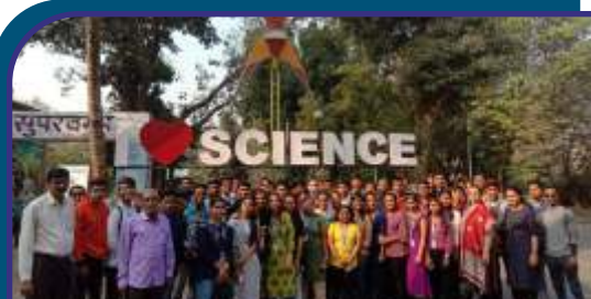
Visit to Nehru Science Centre by Department of Physics