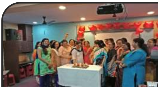
Celebration of International Women's Day