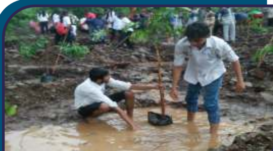
Tree Plantation by NSS Volunteers