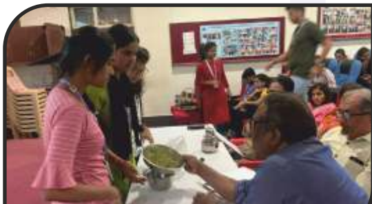
Research Promotion Cell