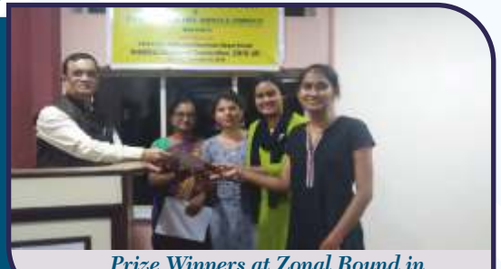
Prize Winners at Zonal Round in Avishkar Research Convention