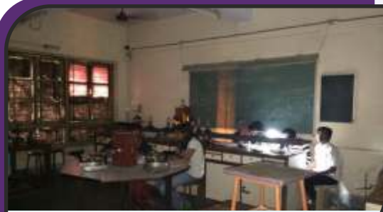
Dark Room at Physics Laboratory