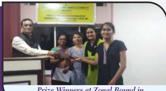
Prize Winners at Zonal Round in Avishkar Research Convention