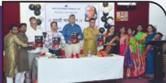
Celebration of Marathi Bhasha Divas organized by Department of Marathi