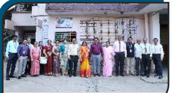
IQAC Committee Members with NAAC Peer Team