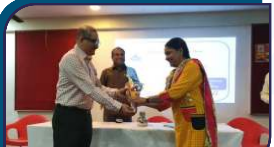
Celebration of National Science Day