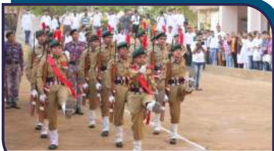
National Cadet Corps (Girls Unit)