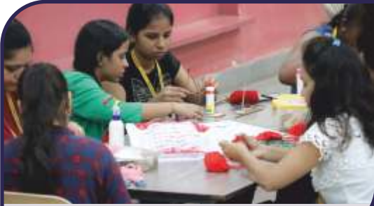
Students' Activity Centre