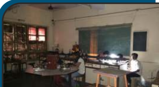
Dark Room at Physics Laboratory