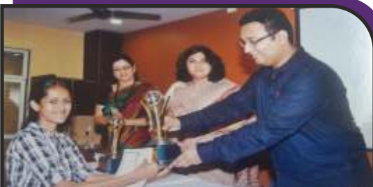
S.V. Kulkarni Inter-Collegiate Elocution Competition