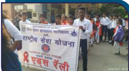
National Service Scheme (NSS)