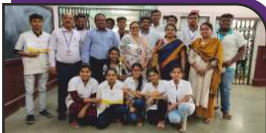
Winners of Poster Competition Conducted by Department of Chemistry