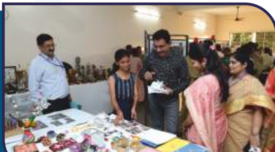
Exhibition of Student's Activities