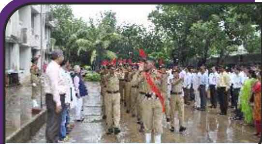
National Cadet Corps (Boys Unit)