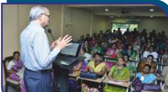
Talk by Hon'ble Dr. Anil Kakodkar