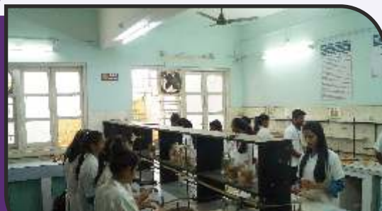
Chemistry Research Laboratory