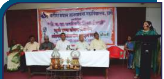
Late G.K. Phanse and Late Indirabai Phanse Inter-Collegiate Elocution Competition