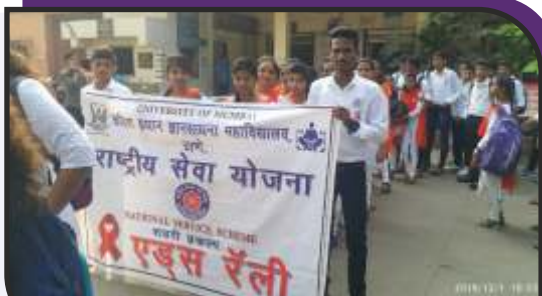
National Service Scheme (NSS)