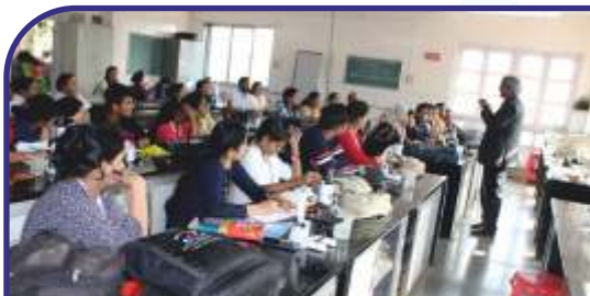
Workshop on Mycology for Students organized by Department of Botany