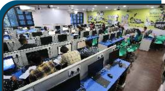
Computer Science Laboratory