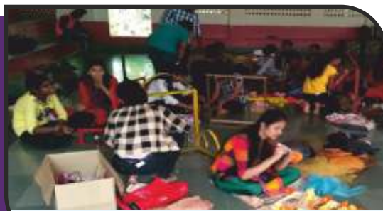
Students' Activity Centre