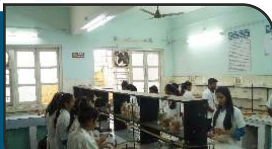
Chemistry Research Laboratory