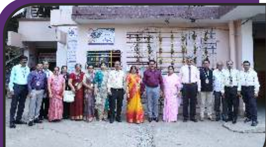
IQAC Committee Members with NAAC Peer Team