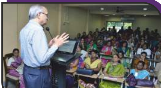
Talk by Hon'ble Dr. Anil Kakodkar