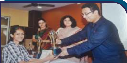
S.V. Kulkarni Inter-Collegiate Elocution Competition