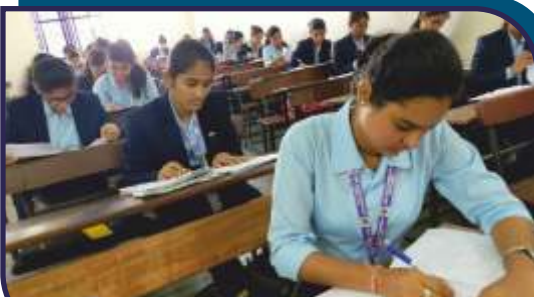
Workshop on Research Methodology