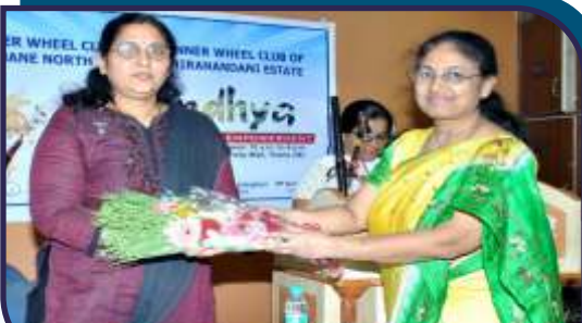
Women Development Cell