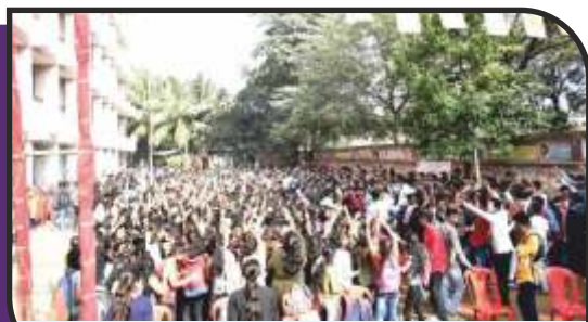
Celebration at Annual Function "Utopia"