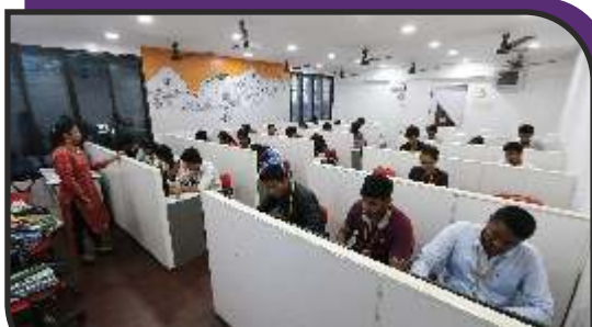
Information Technology Laboratory