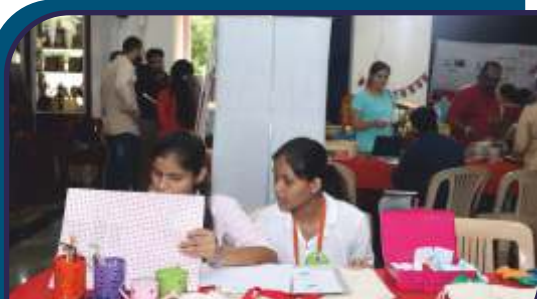
Entrepreneurship by Urja Setu