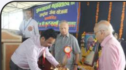
S.V. Kulkarni Lecture Series