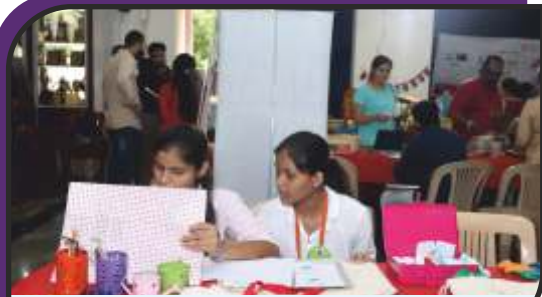
Entrepreneurship by Urja Setu