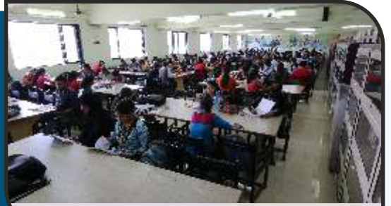
Reading Room at Central Library