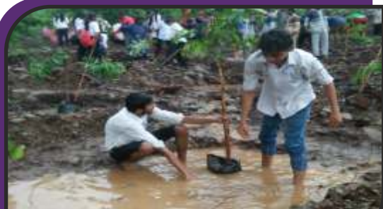
Tree Plantation by NSS Volunteers